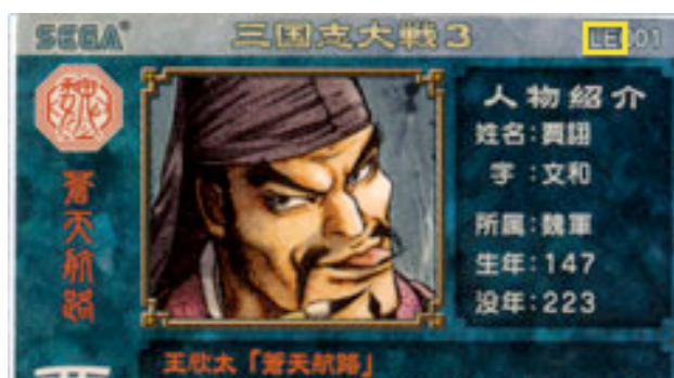
Figure 2: Reading the faction/rarity code (LE in this example)

Please note that the rarity code (LE/EX) will take precedence over the faction code.