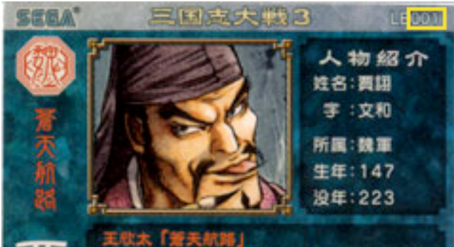
Figure 3: Reading the number code from a general card

There are 2 types of number codes, general and tactician (ST3) number codes. The difference is that the tactician number code will have a “T” in front of the number. To read it, just read the number right beside the faction / rarity code.