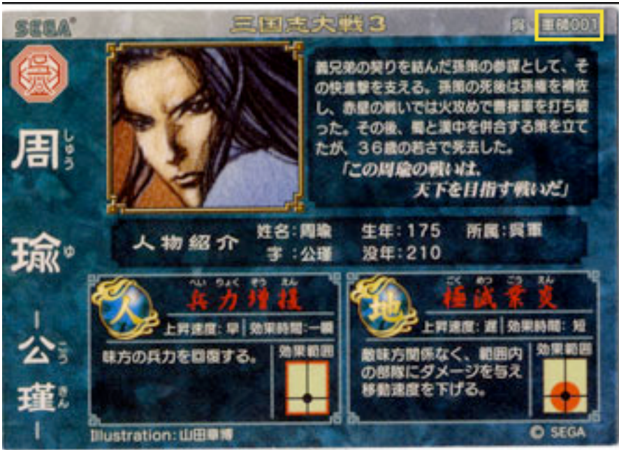
Figure 4: Reading the number code from a tactician card. Please note that tactician cards have the characters “軍師” and “T” in front of the number on the card and on the product code, respectively. Also note that this is only applicable for ST3 cards.